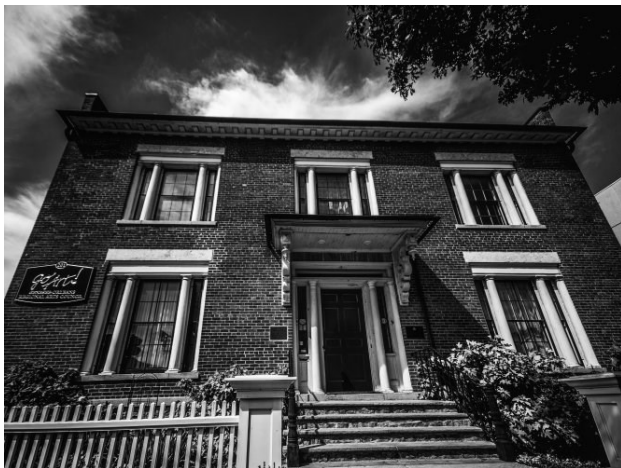
The Seymour Place