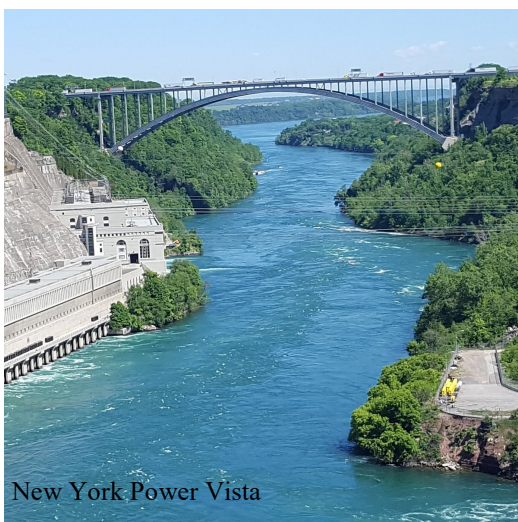
New York Power Vista