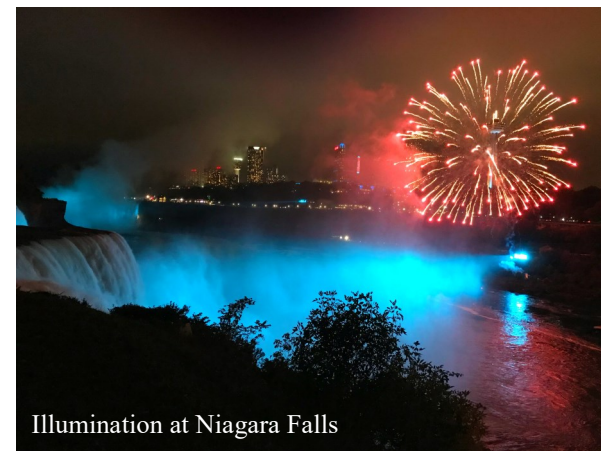
Illumination at Niagara Falls