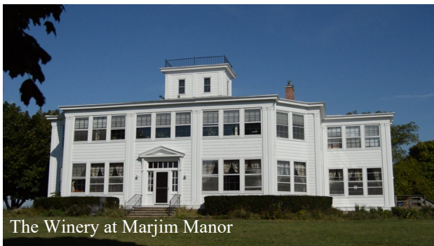
The Winery at Marjim Manor