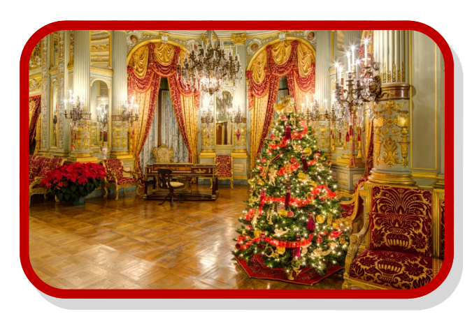
The Breakers Music Room, John Corbett, Courtesy of The Preservation Society of Newport County