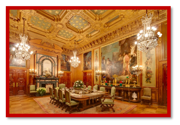
The Elms Dining Room