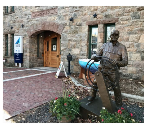
The Sailing Museum

Day 5: Return home with the glittering and dazzling memories of a Gilded Age Christmas. (B)