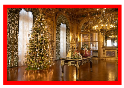
Marble House - Courtesy of The Preservation Society of Newport County

Dinner is included this evening at your hotel. Following dinner enjoy a re-creation of a Newport Cotil-lion . Music will be provided by a local musician as you enjoy dancing a waltz and then learn easy-to-follow steps for a contra dance. (B,D)