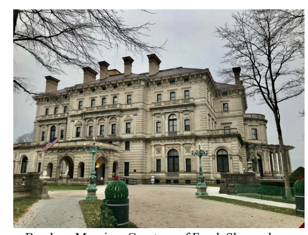
Breakers Mansion

Free time downtown for Holiday Shopping. (B,L)