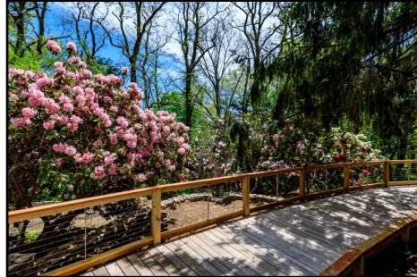
Heritage Museums & Gardens

Visit the Heritage Museums & Gardens in Sandwich, MA. Heritage offers one hundred acres of trees, shrubs, flowers, and sweeping lawns. Be sure to visit the JK Lilly III Automobile Collection Museum , the American History Museum , and the Art Museum featuring an operating, hand-carved Carousel made in 1912. Also, featured, is the Old East Windmill built in 1800 which was moved from Orleans to Heritage in 1968.